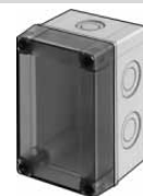
Shallow Enclosure (Transparent Cover)