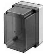
Deep Enclosure (Transparent Cover)