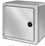
Hinged Cover with 1/4-Turn Latch