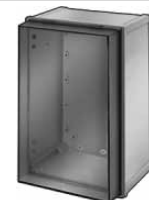
With Latch (Transparent Cover)