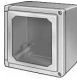
Hinged Cover with Window