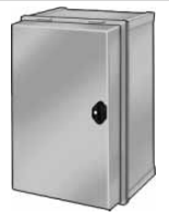
With Key Lock (Opaque Cover)