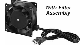
With Filter Assembly