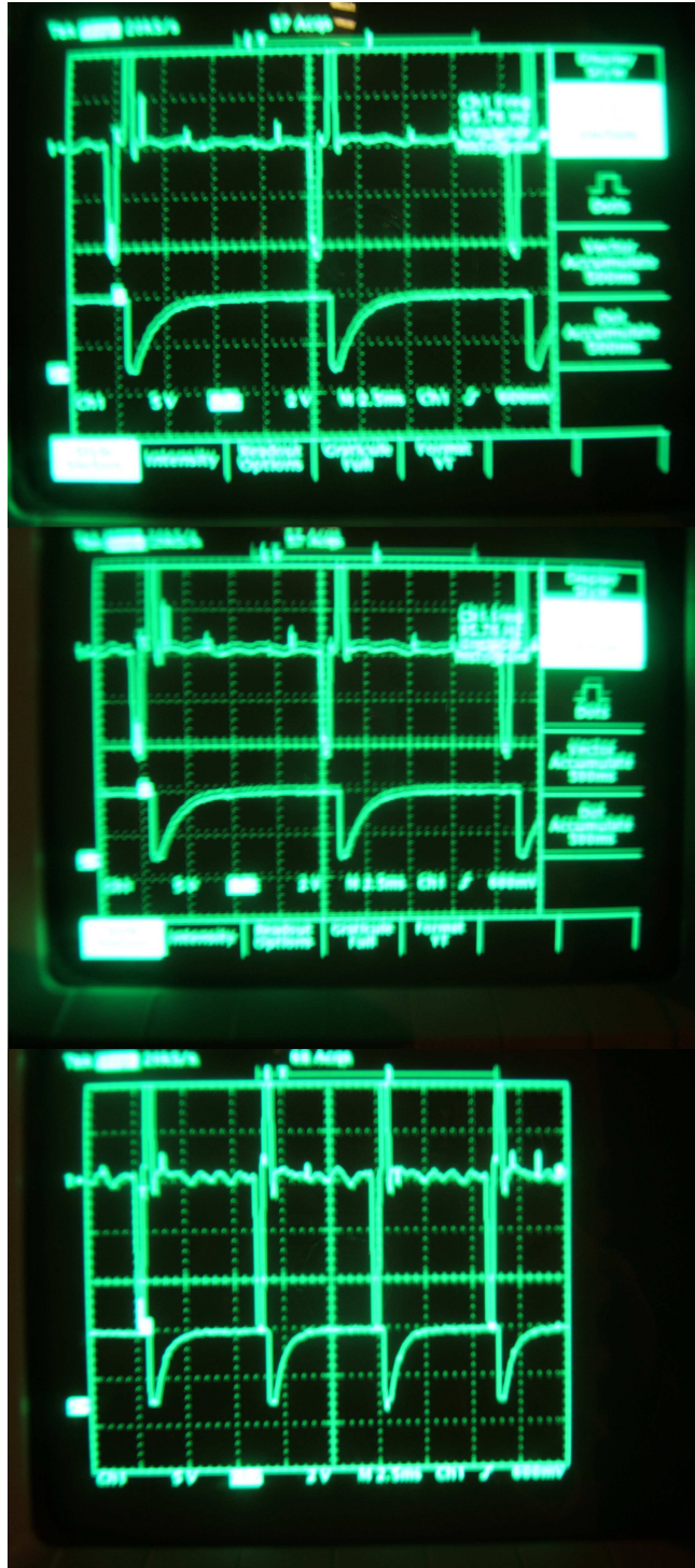
Photo taken for the Oscilloscope when probing the ATV's RPM sensor.