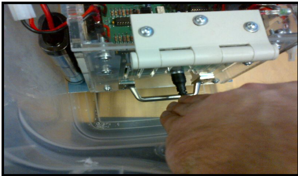
Figure 4 - Connecting the P12401 Power Barrel Connector into the P12402 Port

*Note: if batteries are plugged in prior to the power source being connected to the charging dock, the batteries will not register and will not charge. Be sure to remove any previously connected batteries.