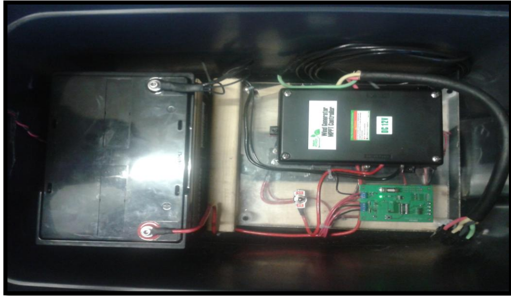
Figure 2 - Inside the P12401 Enclosure