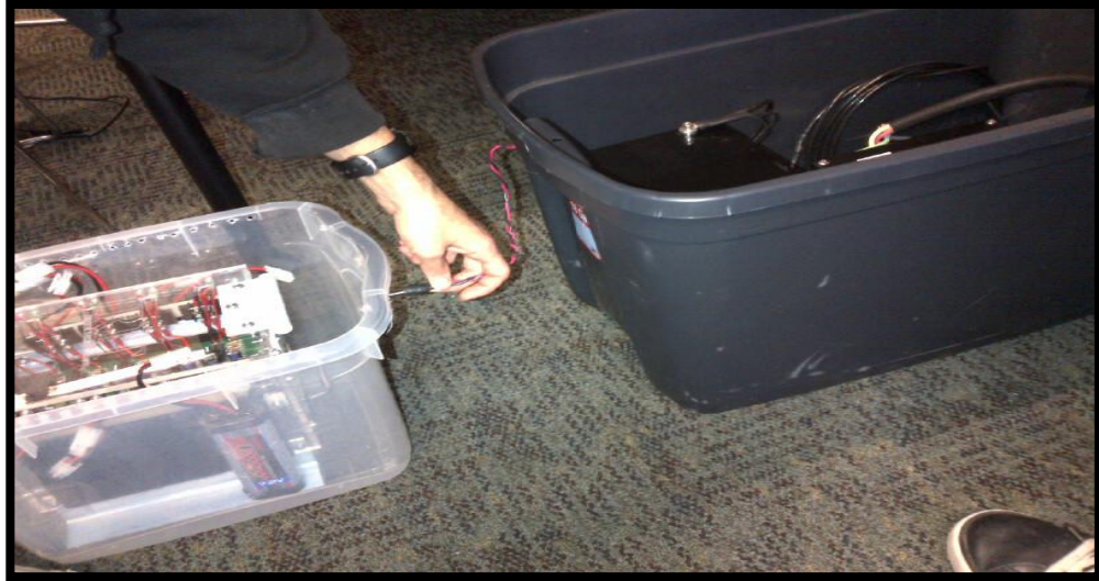
Figure 3 - Inserting the Power Barrel Connector into the P12402 Enclosure