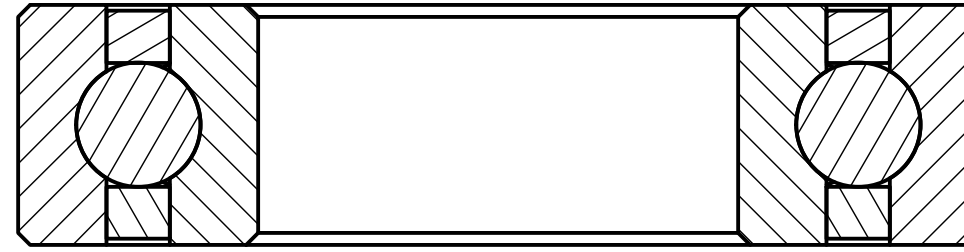
SECTION B-B SCALE 2 : 1