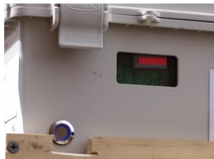
Figure 3: Battery Status Indicator

This 12V dc battery should be able to provide the system with enough power for up to 5+ hours of continuous use. The battery status is indicated on the front side of the enclosure in the “window.” Full bars indicate that the system is fully charged, while less than 2 bars indicate the battery is nearly depleted. Figure 2 shows the battery status indicator. A full re-charge of the battery requires 8 hours.