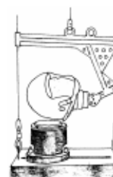
Rear Boss Impacts