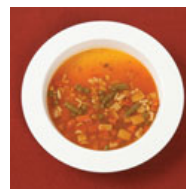
Ergo Plate - White