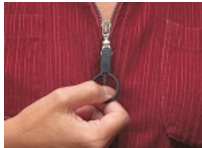
Zip Grips Washable Zipper Rings (zip-grips.html)