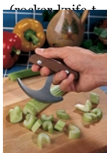
Rocker Knife with T-handle (rocker-knife-t-handle.html)