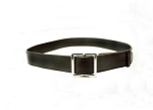
Myself Belts One Handed Brown Leather Belts (myself-belts.html)